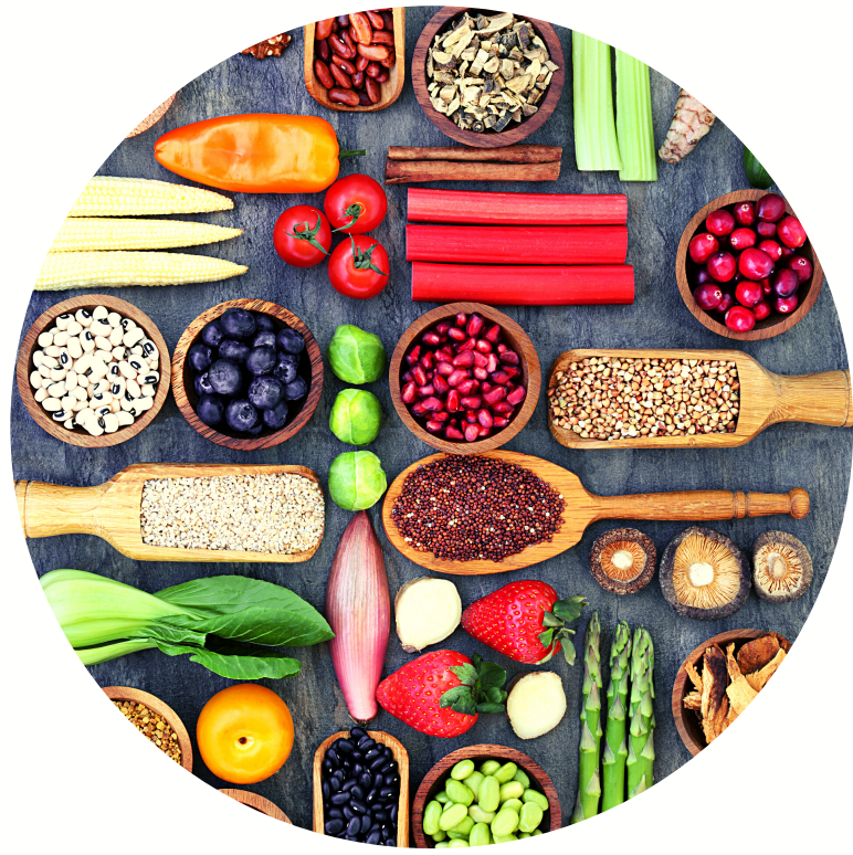
FOODS AND NUTRITION